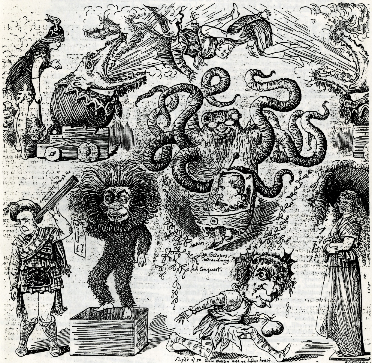
A contemporary illustration of some of the special effects in a Conquest pantomime, Grim Goblin. The monkey is being projected from a 'star trap', a very hazardous special effect. The octopus (note the trick eye) holds a portrait of the man inside it. George Conquest - who was also the monkey, the dwarf and the human cannonball.

In the harlequinade the main characters were changed into Harlequin, Columbine, Pantaloon and Clown for the second part of the performance. This harlequinade was the original pantomime; the story began as an introduction to it and gradually became more important, pushing the harlequinade to the end of the performance and eventually ousting it altogether. The process might have happened more quickly but for the popularity of Joseph Grimaldi, who made Clown rather than Harlequin the main character. The actors wore huge masks called 'big heads' for the first part of the performance (the 'opening') to conceal their harlequinade makeup which was revealed in the second part.